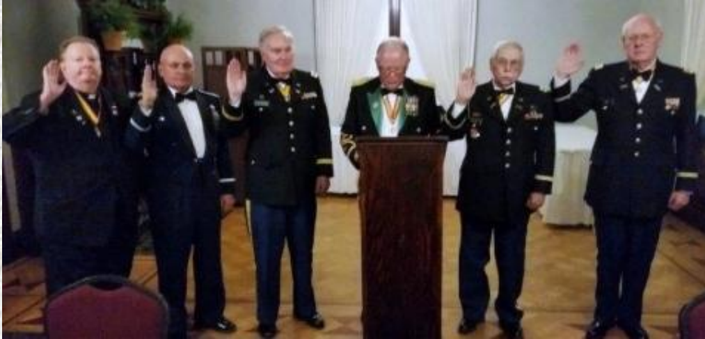
New Officers taking Oath

A Change of Command ceremony and the Installation of new officers of the RI Commandery of the Military Order of Foreign Wars of the United States was held on 14 June at Spirito's Restaurant in Providence.