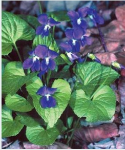
Rhode Island State Flower Violet Viola Sororia

The Commandery supported the Junior Reserve Officer Training Corps (JROTC) awards program for the 2022-2023 academic year. The MOWF medals are presented in Bronze for Academics and Silver for Leadership .