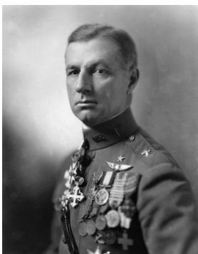
Then-Brigadier General William L. Mitchell

Note: The 96th Article of War, was a catchall provision of military law that allowed an officer to be tried for just about any action deemed to be ". . . of a nature to bring discredit upon the military service."