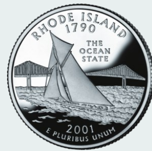
2001 United States Quarter State Series (Proof)