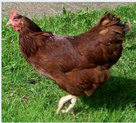
Rhode Island Red State Bird

To all my comrades of Military Order of Foreign Wars – Rhode Island Commandery, I want to thank you all for the opportunity to be your Chaplain and to hopefully provide spiritual input in our new newsletter as we initiate this wonderful means to remaining connected.