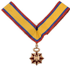
Military Order of Foreign Wars of the United States (Neck Suspension Medal)