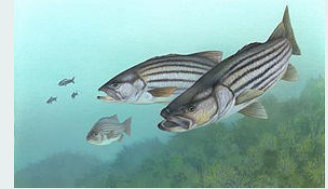
Rhode Island State Fish Stripped Bass